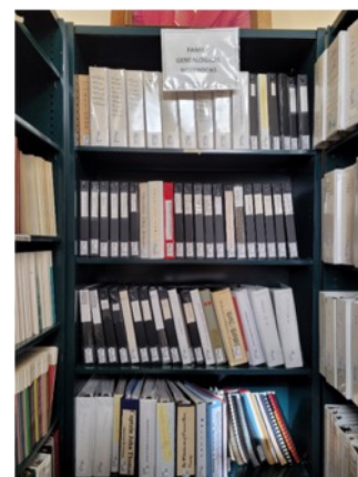
Genealogical Family Binders

Another addition to our room is our collection of Genealogical Family Binders. These are family genealogies that have been donated by people who have researched their family histories and now want to share them with others who have a common ancestor. Like the scrapbooks, they are security-coded with an index on the shelf to help locate a specific family binder. As always, volunteers are available to assist you.