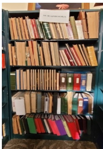
Scrapbooks on Display