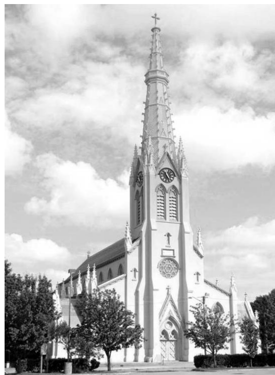
Basilica of St. Mary of the Immaculate Conception, Norfolk, Virginia