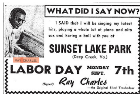
Advertisement for Sunset Lake Park from September 7, 1959 issue of the Norfolk Journal and Guide