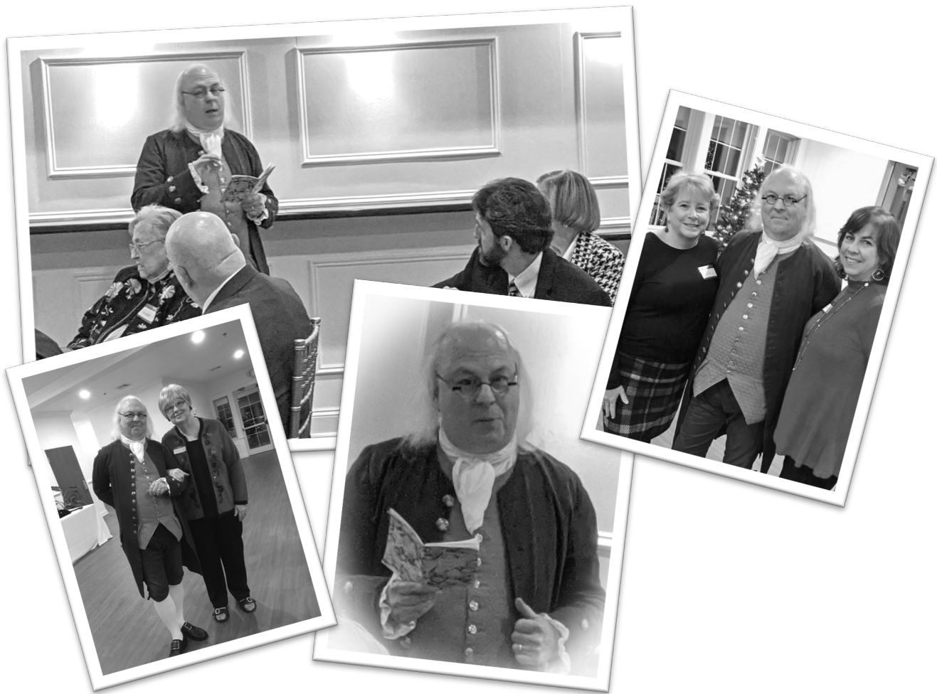
Photo Album: 2019 Annual Dinner – “Christmas with Benjamin Franklin”